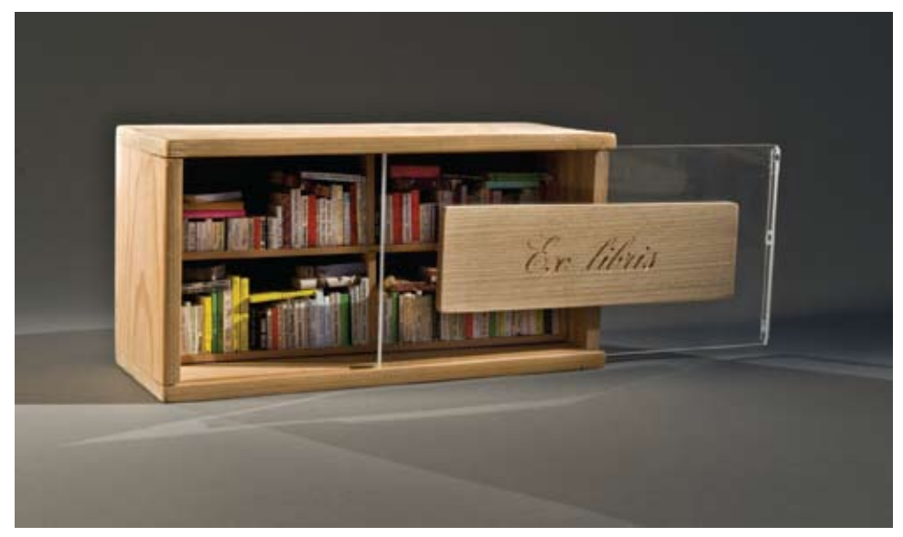
EUGENIO MICCINI (Italian) Ex Libris, 1981 Wood, paper, and Plexiglas, 6 x 11% x 4% inches