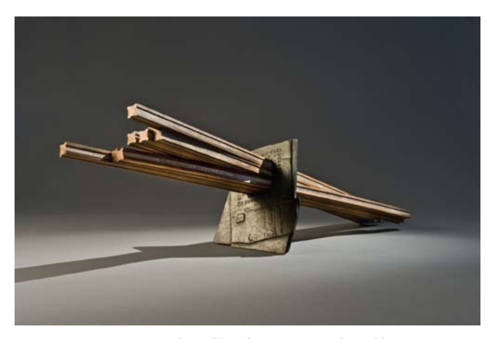
ANIK VINAY (French) and ERIC MACLOSE (French) Pour l'infant, 1999 Wood, bronze and paper, 24 x 3½ x 3½ inches

Artists' books challenge us to rethink our reading of the book as a form and as a conceptual tool. Johanna Drucker has called the twentieth-century the century of artists' book, and she notes, in the conclusion to the book by that title, that the emergence of electronic forms have steadily increased artists' book production, and created new possibilities, rather than spelled the Book's last hurrah. The artists' books that emerged in the twentieth century, as opposed to the collectible deluxe editions and illustrated books, called livre d'artiste , stress the integration of the material structure and form with thematic and aesthetic issues. This exhibit looks at one variant of artists' books: the sculptural book. The exhibit includes a wide range of works along the spectrum from sculptures that reference books to books that reference movement and shape beyond the bound page and codex form. Including works that