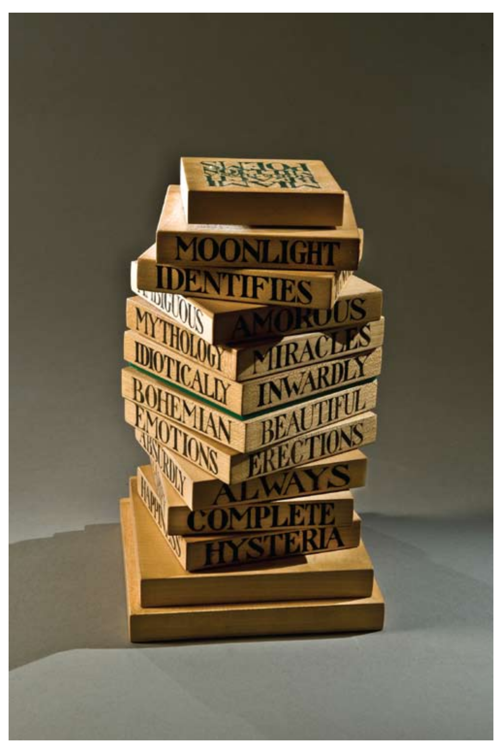
TOM PHILLIPS (British) Miami Beach More Than a Million Poems, 1986 Wood, ink and felt, 10½ x 6 x 6 inches