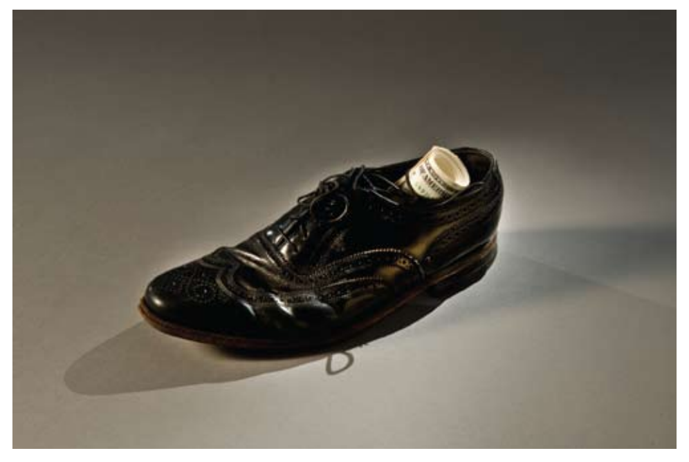
CLARK COOLRIDGE (American) On the Slates, 1992 Leather shoe with paper,3% x 11% x 4 inches

Books have more to offer than 25 lines to a page of words.